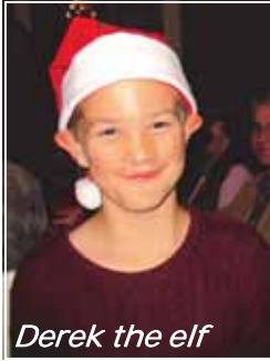
Derek the elf