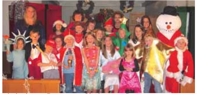
Asheboro Brower's Christmas Program

Christmas broke out all over the place in our local churches as well. Over 1,500 people attended Christmas Sunday services and 2,000 people came to the Christmas Eve Communion Service at Durham newhope.