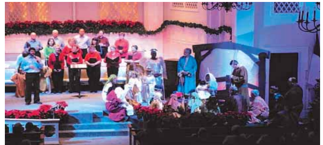
Greensboro Christ presented, 'He Came for Me'