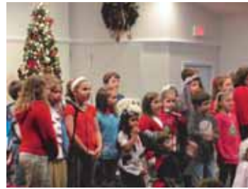
Christmas Program at Asheboro Foster Street

The house was packed full at Asheboro Foster Street on Christmas Sunday morning, with people standing, not able to get a seat.