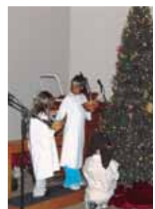
Angels gathered around the tree at Goldsboro

It is our great joy and privilege to serve you, and we look forward to a wonderful new year together!